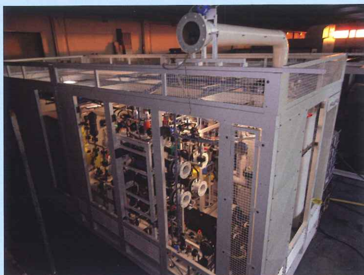
ECOLCELL SW DUAL USE 20KgCl 2 /h Offshore installation ATEX II 2G Exd IIC T6

Compact, supplied into a shelter or skid mounted for a safe installation in hazardous area- zone 1 and 2.