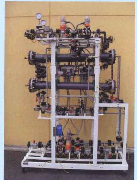
2 x 4 KgCl 2 /h Electrolyser Module ATEX II 2G Exd IIC T6 Offshore Installation