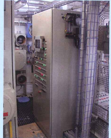
ECOLCELL SW DUAL OFFSHORE

ACG is leader in electrochlorination systems since 1947. ACG operates according to FEED ( Front End Engineering Design).